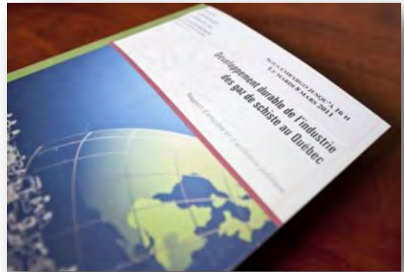
BAPE report released in March 2011